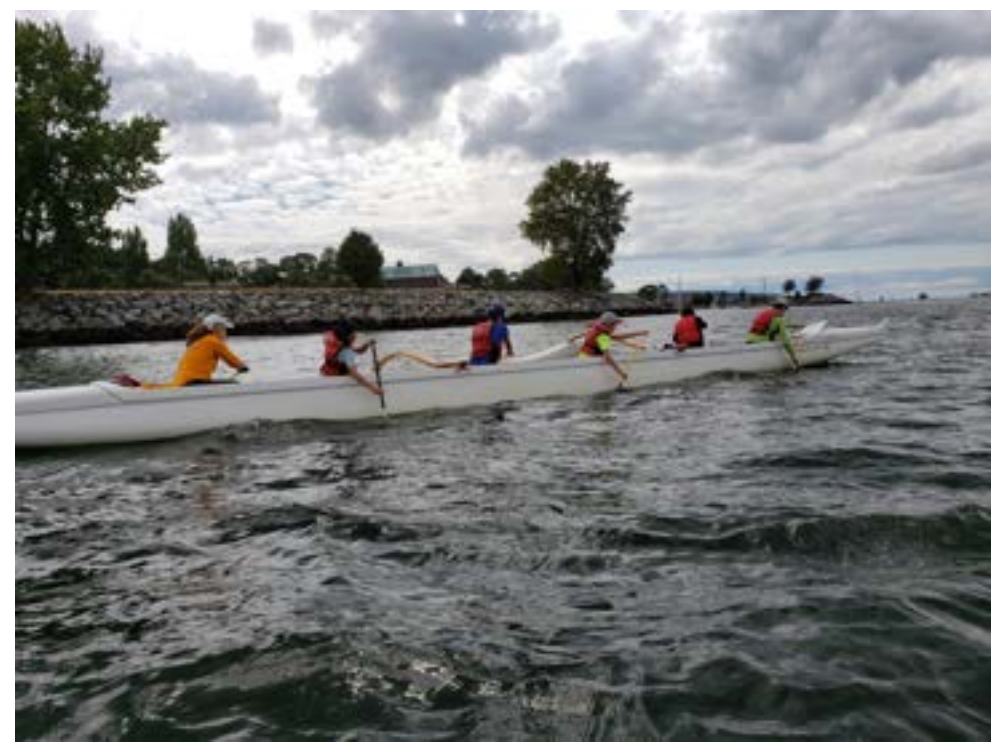
Youth and Lori (steering) at the Youth OC-6 'Try It' Event